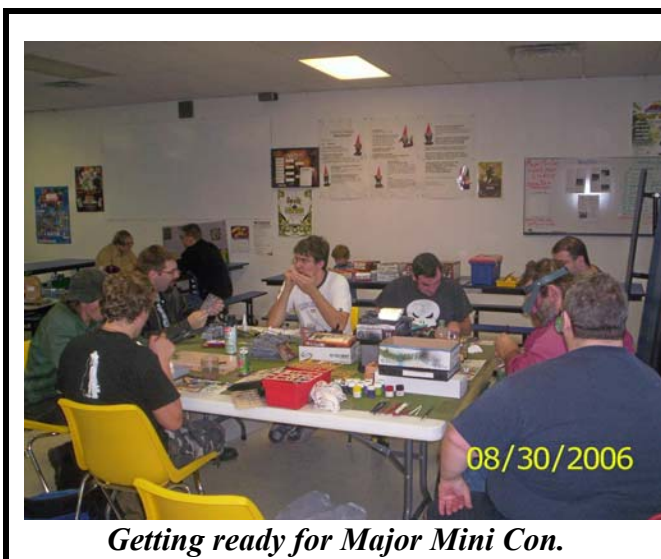
Getting ready for Major Mini Con.

Meetings just keep growing and growing. Wednesday night is becoming a very popular time for us miniatures enthusiasts. Lots and lots of newly painted minis flying off the tables. Many of the newly painted will be available for your enjoyment at our Major Mini Con scheduled for Oct 13-15. Armies galore, more fun than you can imagine, don't let an opportunity like this slip by. -JR