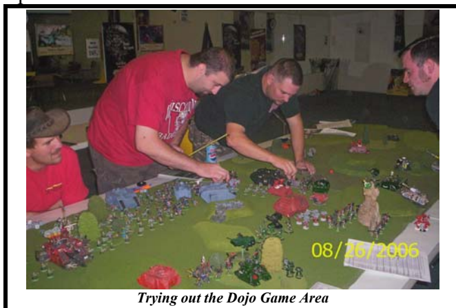
Trying out the Dojo Game Area

There’s still time to add your favorite miniature, historical, sci-fi, or fantasy game to the convention schedule. A “SWAP MEET” side event has been added with more details to come. Sign up today at Gnome Games and be part of the fun! -PF