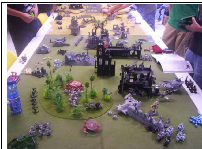
Medusa V – Lots of gray and black figs – Hey Guys, looks like you need to come to Painters Guild and learn from the old-timers! -pf